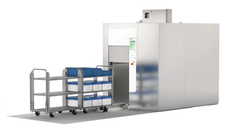
Ergonomic for High Demand

Belimed offers standard instrument racks and transport carts designed to maximize the internal chamber dimensions.