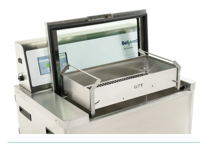
Three available Trays: Standard Tray and a 5 or 10-Port Flushing Tray for Cannulated Instruments