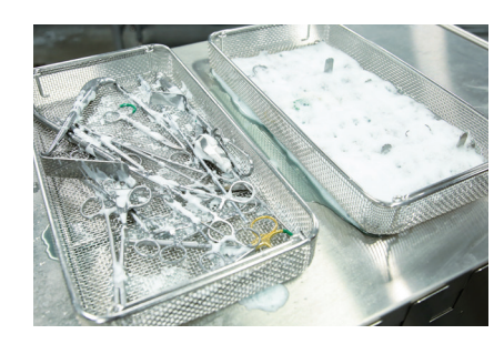
Triple the Coverage